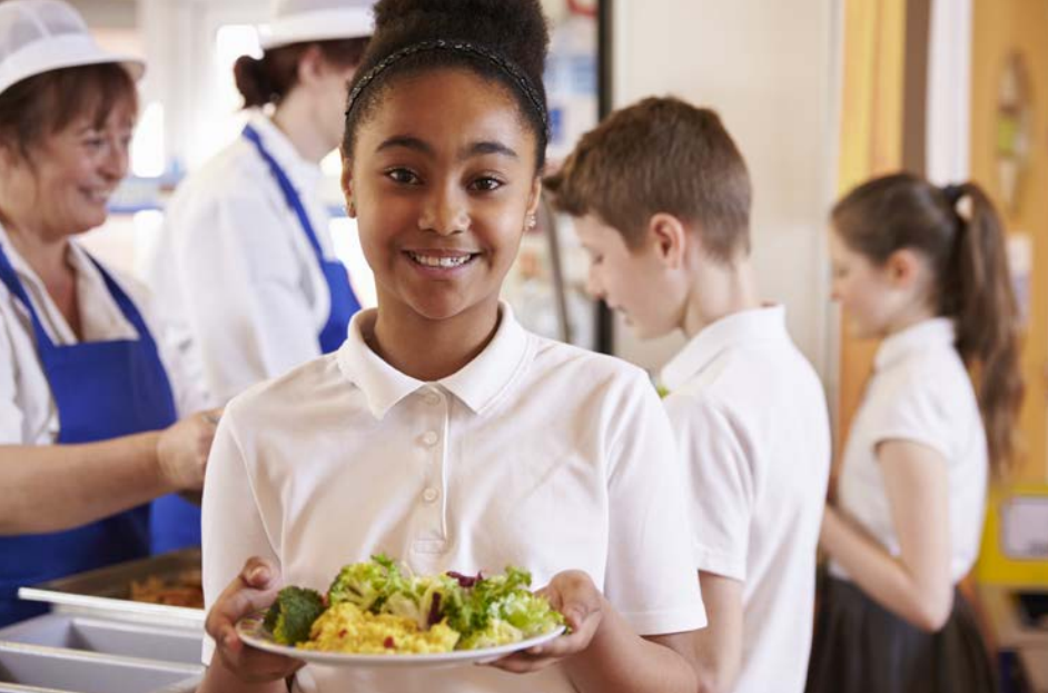
Revolution Foods provides 300,000 chef-crafted meals to community and school feeding sites each day.